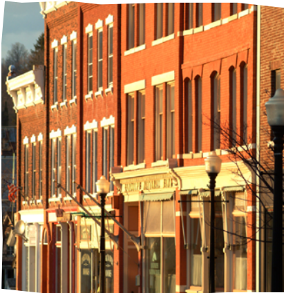
Downtown Randolph, VT